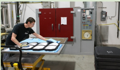
A Hesco employee arranges protection armor for further processing at the Coastal Innovation Zone.

Hesco Armor, Inc. has recently doubled its manufacturing capacity at the Port and continues to be a leading supplier of body armor for law enforcement.