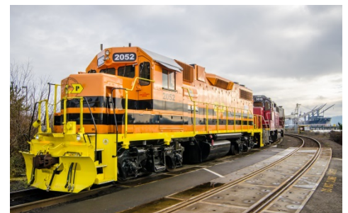
A PSAP locomotive pulls empty rail cars around the loop track as a vessel loads at Terminal 2 in the distance. PSAP connects the Port of Grays Harbor and its customers to both Class I railroads, UP and BNSF.

To join our mailing list contact Kayla Dunlap at kdunlap@portgrays.org